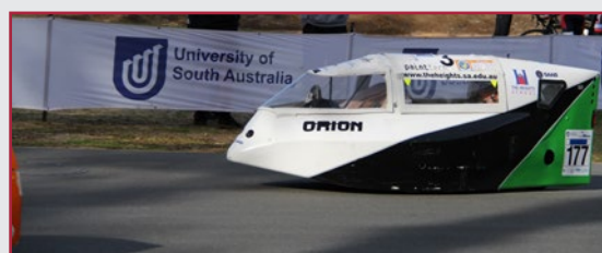
Old scholars and parents racing in Orion on Saturday