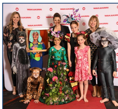
Performers with the judging panel