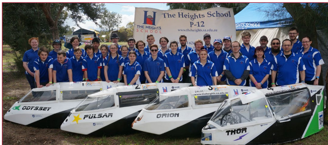
Our 4 teams on Saturday morning ready to race in our 15th consecutive year in the Australian International Pedal Prix 24 hour event.