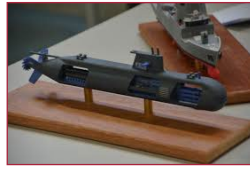
Sub and Destroyer