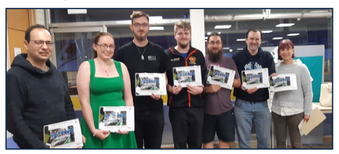
Our fantastic, devoted Pedal Prix mums and dads and old scholars all worked to make our 15th consecutive Pedal Prix a success once again in 2019. Some of our committee are also riders in the open category.