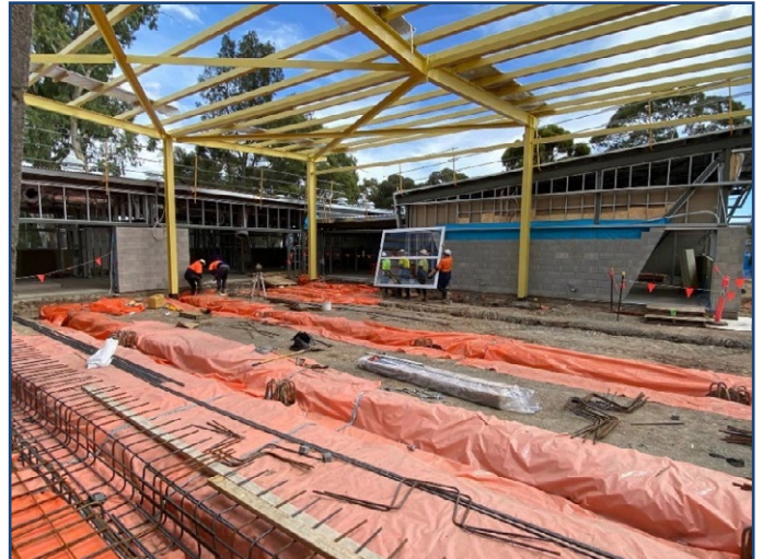
Glass is arriving!