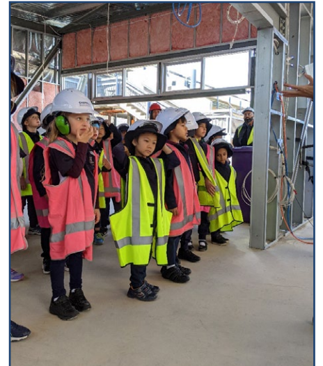
Year 1 students from CF9 taking it all in