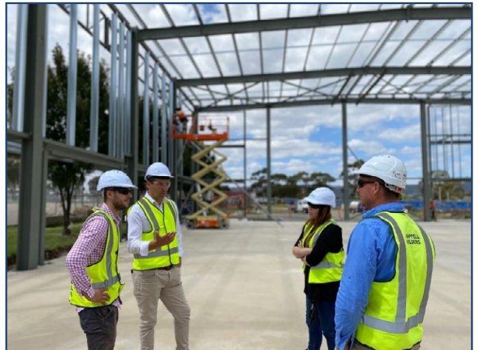
Chappell Builders welcome a visit from Blair Boyer MP, Shadow Minister for Education