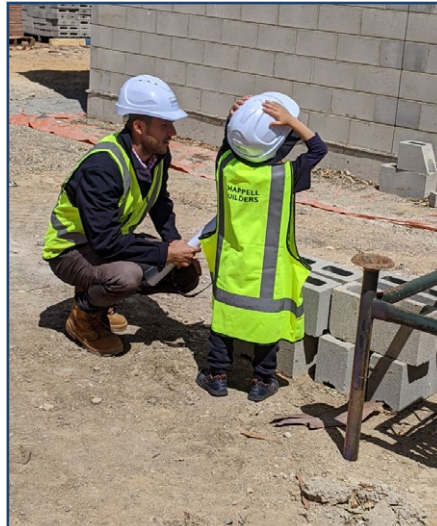
"When I grow up I want to build things"