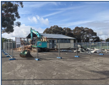
F Block – Year 5 classrooms