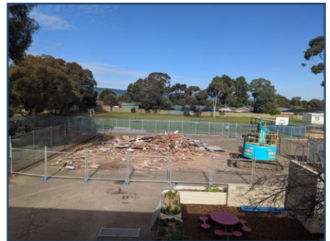
E Block – Year 6 classrooms