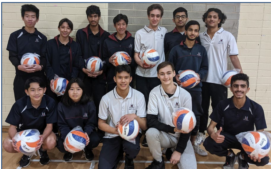
Winning players listed above