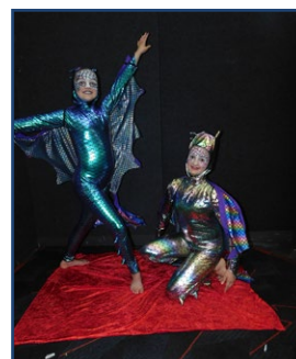
Mum and Baby