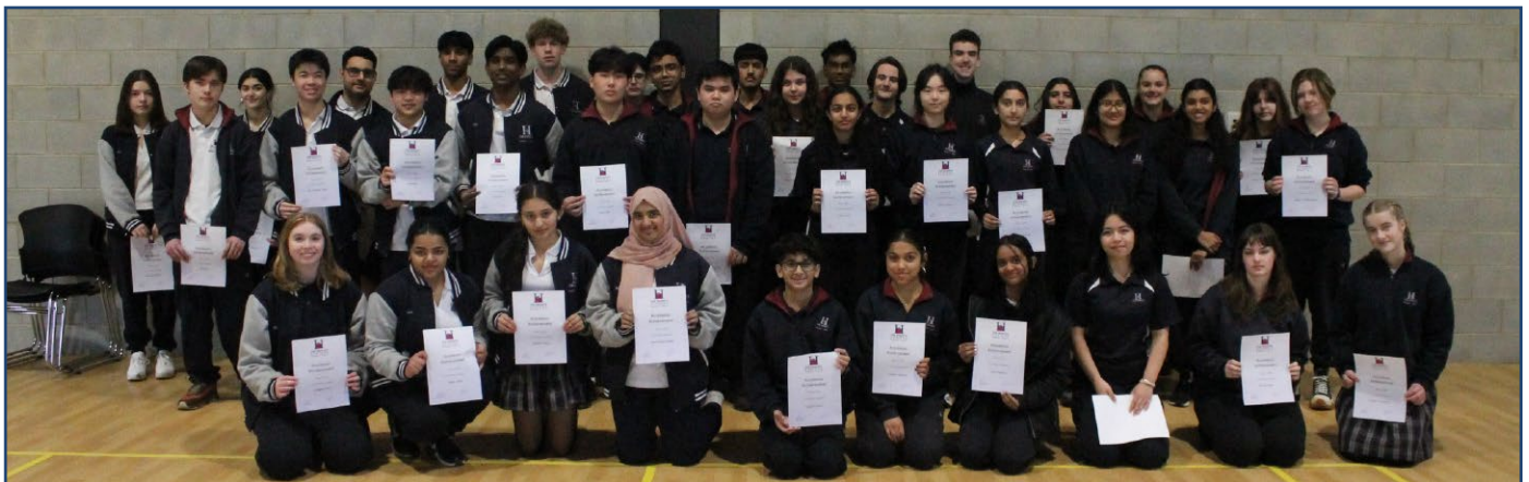
Year 10-12 Academic Achievement