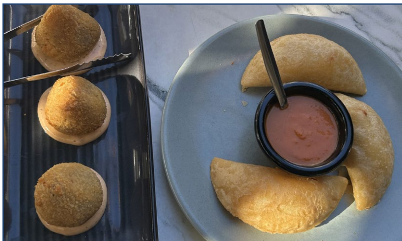
La coxinha y las empanadas