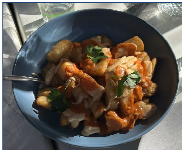
Las patatas bravas