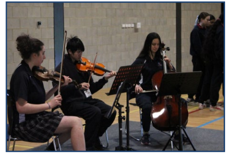
Year 10-12 Music performance