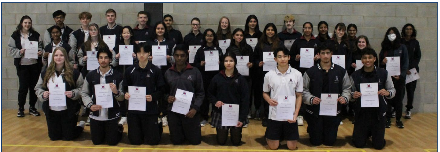
Year 10-12 Principal's Award