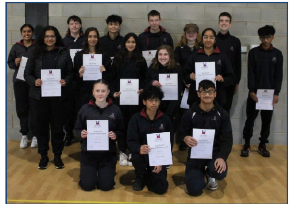
Year 10-12 Significant Improvement