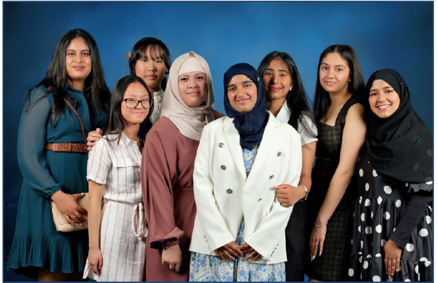
A beautiful moment